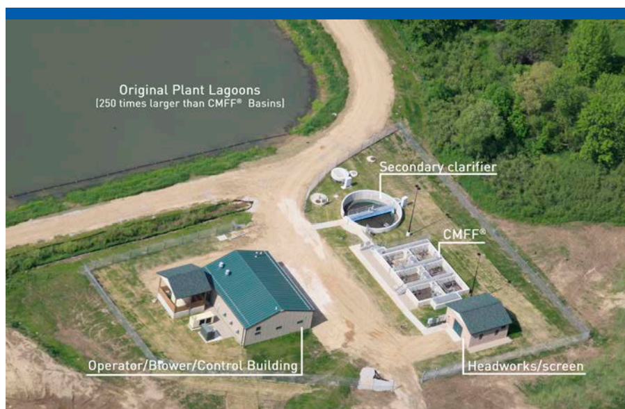
Overview of the Bloomington plant