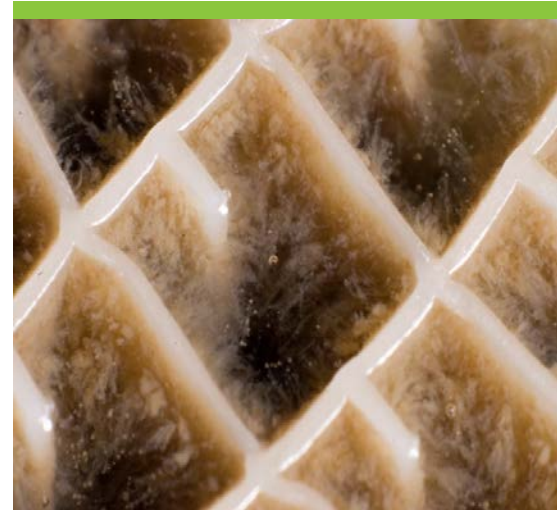
Close up BWTX with solids

HEADQUARTERS Biowater Technology AS Rambergvn. 5, 3115 Tonsberg, Norway Phone: +47 911 10 600 email: post@biowater.no