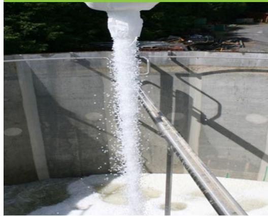
Bioreactor being filled with media.

The CFIC® process is designed to increase treatment capacity while reducing footprint and overall energy costs.